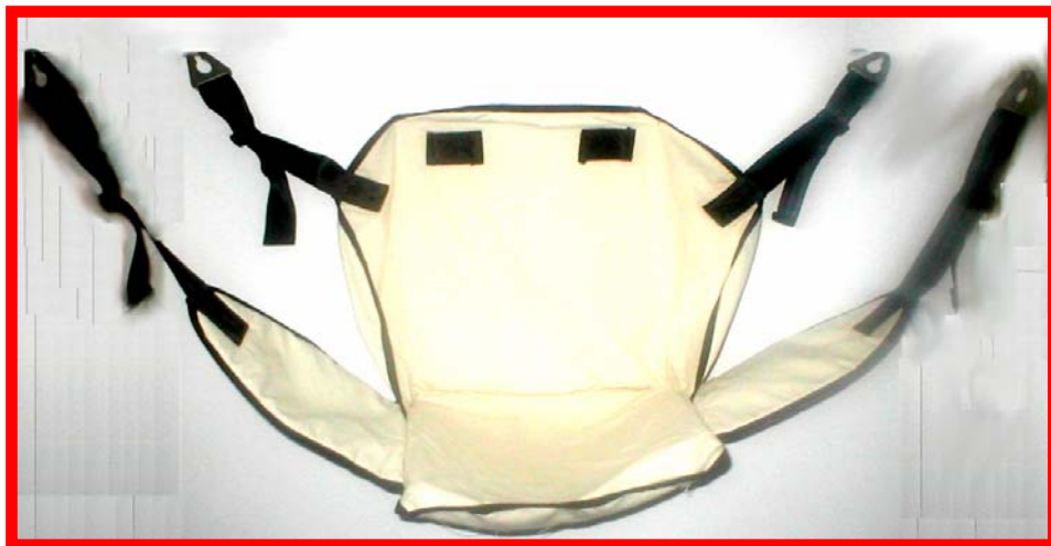
Osteogenesis Imperfecta (Brittle Bone) Sling