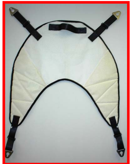
Juvenile General-Purpose Sling