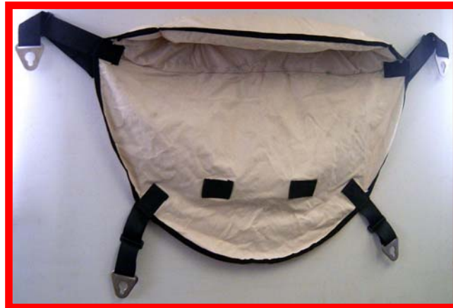
Double Amputee Sling