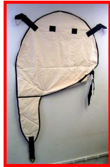
Single Amputee Sling