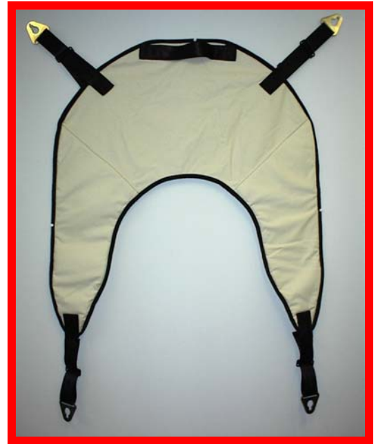
General Purpose Sling (GP) White Poly-cotton Fabric Standard Sizes: Juvenile (J) 1, 2, 3, & 4 Long Sizes (L): 1L, 2L, & 3L