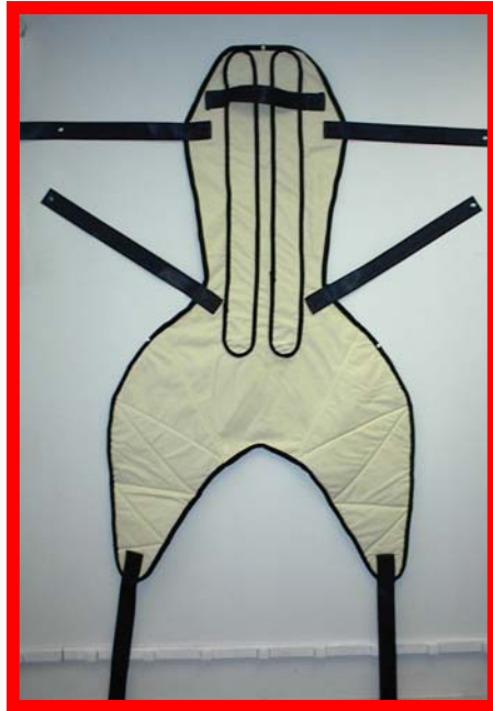
Head support: white poly-cotton or nylon mesh (made to order- allow 2 weeks for delivery) Sizes: all standard sizes